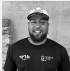
TK YOUTH WORKER

Fav Quote: "Every day of my life, I'm trying to find a way to get better." - Ray Lewis